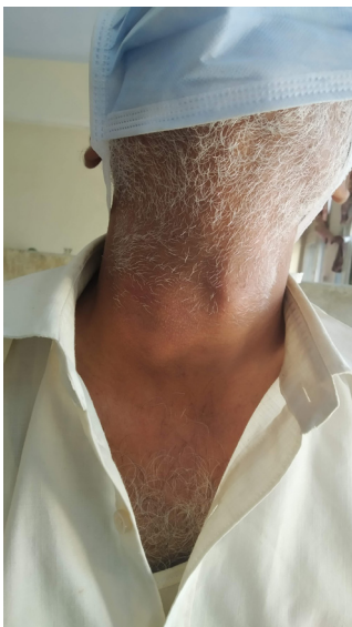
Figure 2. Clinical photograph of the patient with a swelling in the right side of the neck with erythematous overlying skin.

Upon arrival at Pandit Bhagwat Dayal Sharma Post Graduate Institute of Medical Sciences, he was alert, febrile (temperature 39°C), with a heart rate of 116 beats per minute, blood pressure of 108/60mmHg, and the room air oxygen saturation was 96%.