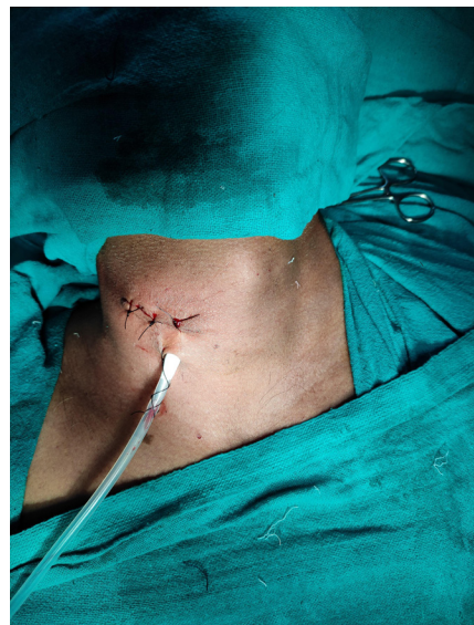
Figure 3. Post-operative photograph with a flat drain in-situ.

The patient was taken to surgery for urgent drainage of the abscess under general anesthesia. Pus and necrotic tissues were removed, and the wound was loosely closed over with a flat drain (Figure 3). During surgery, neither the initial colloid nodule nor any fistulous tract could be defined separately due to intense inflammation. The postoperative period was uneventful. Pus drained at surgery was sent for culture sensitivity study but no growth was observed. The symptoms subsided and the patient was discharged on the 5 th postoperative day (after drain removal) with the advice to continue antibiotics for one week. At the two-week follow up, repeat flexible bronchoscopy showed resolution of the previous inflammation with no definite opening, indicating healed tracheal fistula.